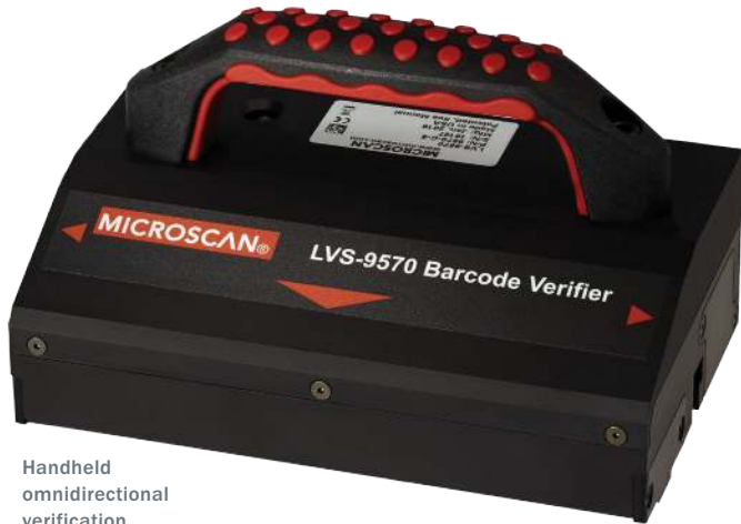
Handheld omnidirectional verification